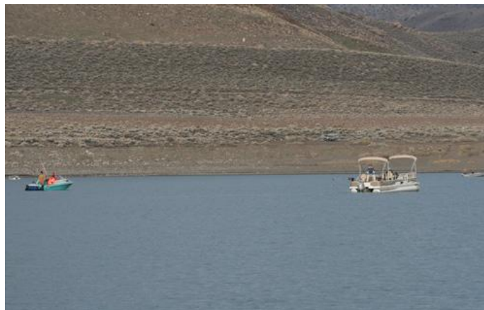
Fishing boats on February 14.