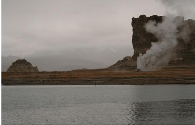
The geyser at the Needles.