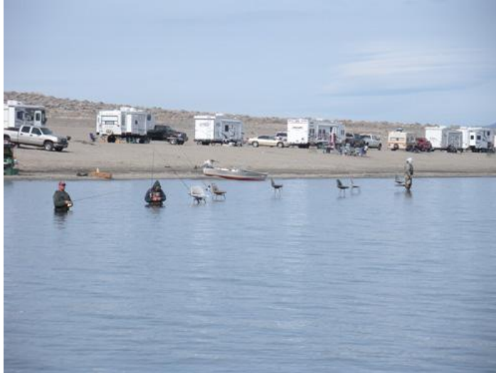
Fishing at Pelican Beach.