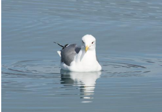
A seagull decided to join us.