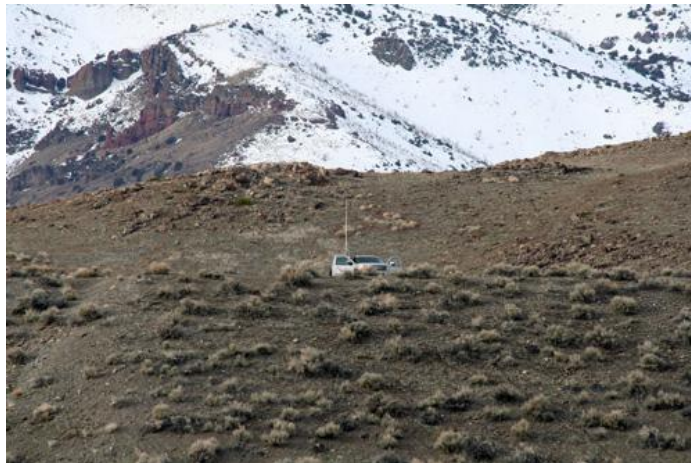
Mobile communications on top Spider Point February 14.