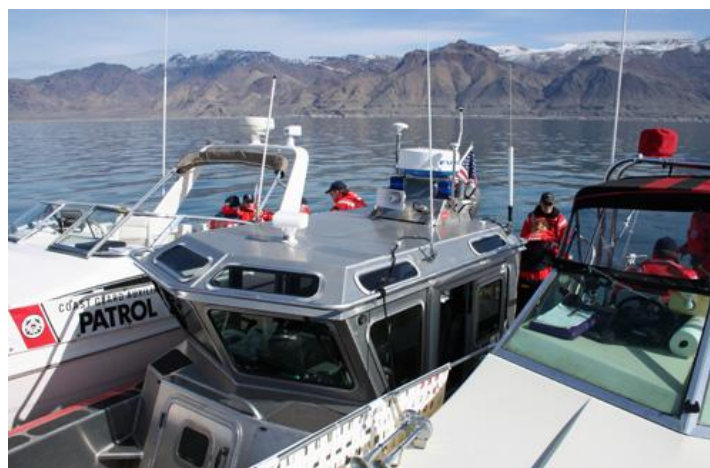
Shiv'r Me Timbers rafted with Carolyn J and 0579 to share the lunch barbeque.