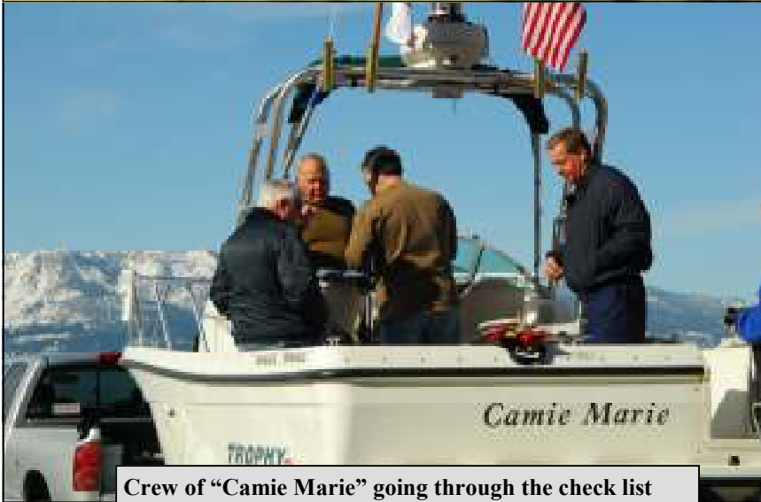
Crew of "Camie Marie" going through the check list