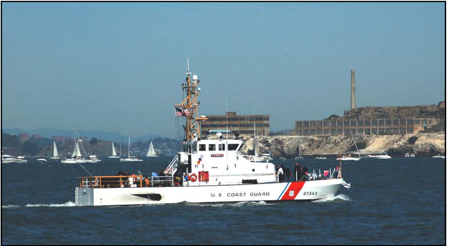
USCG Cutter Tern, passing Alcatraz, San Francisco Bay

Department of Homeland Security United States Coast Guard Auxiliary DSO-PB 11 NR 2333 Lariat Lane Walnut Creek, CA, 94596-6518