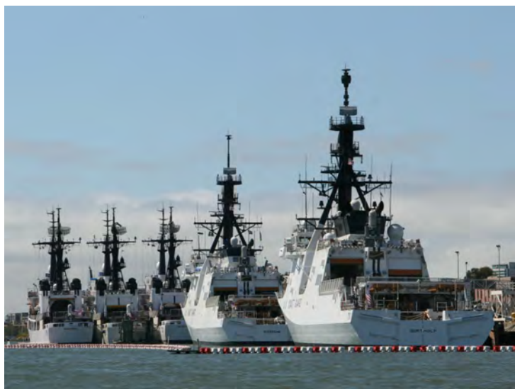
Photo includes (from back to front) the two newest cutters, the first two National Security cutters, the Bertholf and the Waesche, then 3 of the WHEC 378-footers (from left to right) the Boutwell, Sherman, and Morganthau. Taken August 8, 2010. from the deck of the AUXFAC Silver Charm

The Coast Guard Training Center (TRACEN) Petaluma at Petaluma, California offers the latest equipment and training technology to train the next generation of Chiefs, cooks, medics, storekeepers, yeomen, as well as information technology, electronics, and operations specialists of the U. S. Coast Guard.