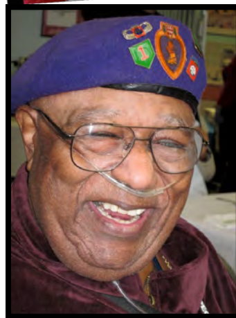
Veteran sharing his stories of Korea