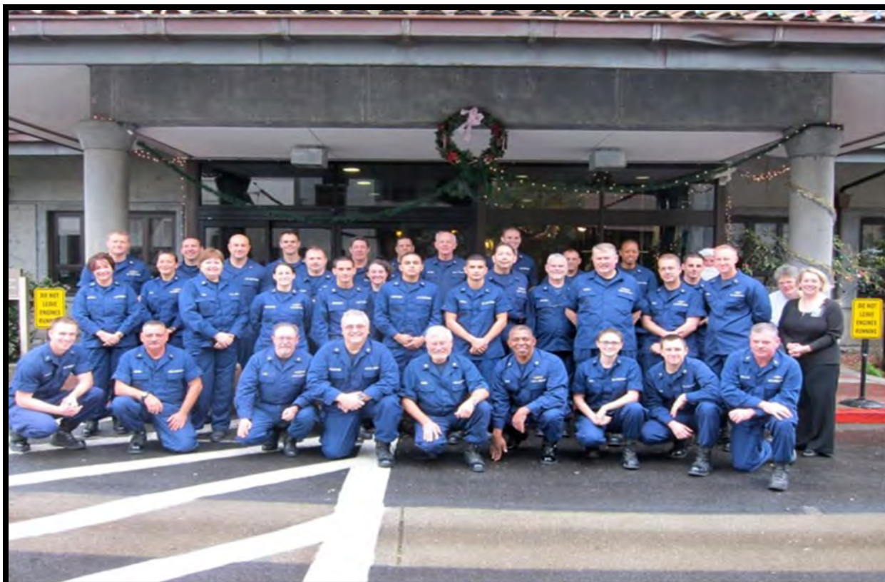
The entire Team of AUX & Sector S.F. prior to gearing up for supportive roles at the 3rd Annual Vets Christmas Party