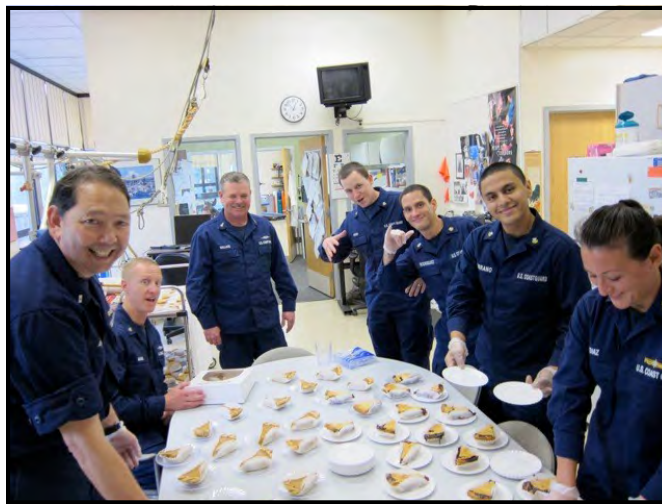
Some of the Coast Guard crew